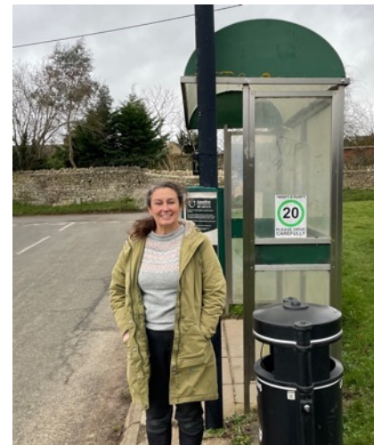
PROTECTING VILLAGE BUS AND TRAIN SERVICES