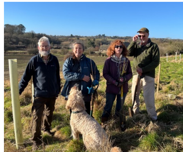
SUPPORTING NATURE RECOVERY, RURAL JOBS AND REGENERATIVE FARMING