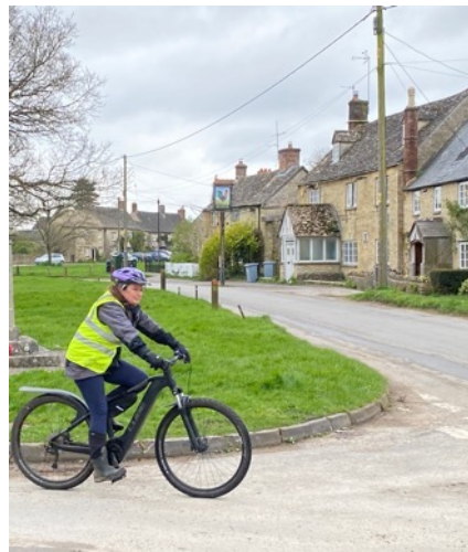
REDUCING TRAFFIC SPEEDS MAKING ROADS SAFER