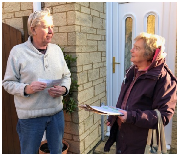
COST OF LIVING: SUPPORTING PEOPLE WITH BILLS AND ENERGY USE