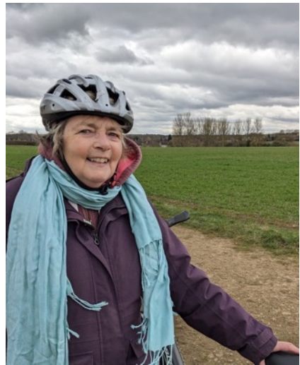
FLOODING AND TRAFFIC: OPPOSING 1400 HOUSES