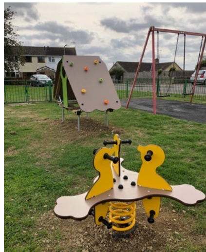
COMMUNITY: INVESTING IN OUR PLAY AREAS