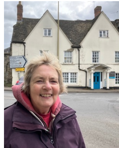
AIR QUALITY: PUSHING FOR ACTION ON BRIDGE STREET