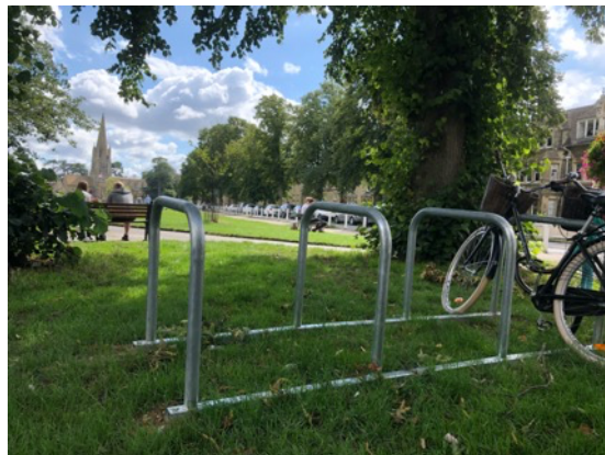
Andrew pushed for the new bike racks in the town centre

give more space for people visiting the town centre and reduce the spread of Covid-19. He has proposed planters and "road open" signs for a more welcoming feel.