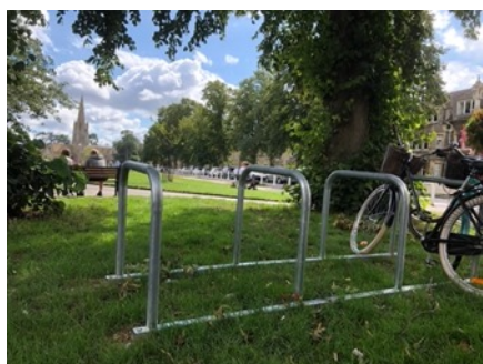
Church Green: vital green space at the heart of Witney