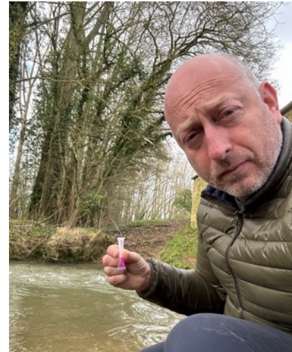
PROTECTING OUR RIVERS AND COUNTRYSIDE