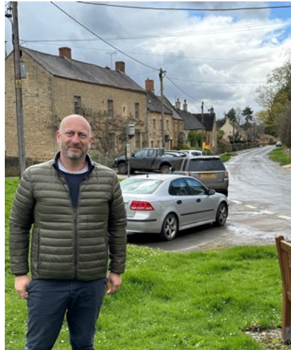
TAKING ACTION ON SECOND HOMES