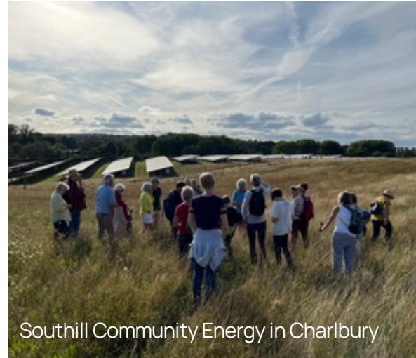
Southill Community Energy in Charlbury