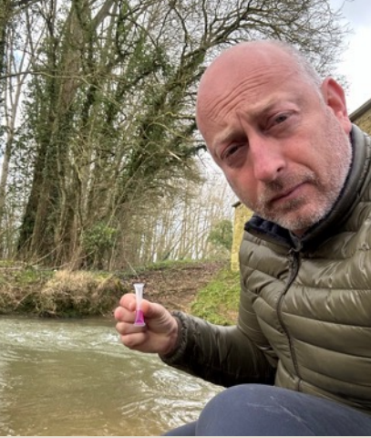
PROTECTING OUR RIVERS AND COUNTRYSIDE