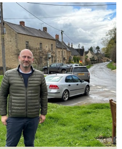
TAKING ACTION ON SECOND HOMES