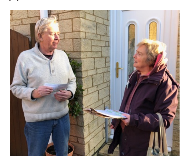
COST OF LIVING: SUPPORTING PEOPLE WITH BILLS AND ENERGY USE