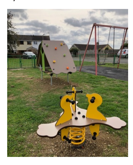
COMMUNITY: INVESTING IN OUR PLAY AREAS