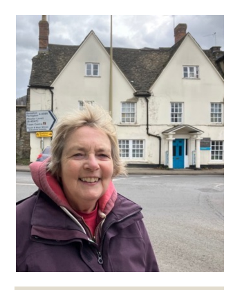
AIR QUALITY: PUSHING FOR ACTION ON BRIDGE STREET