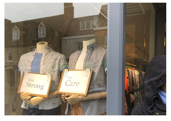
Community support signs in Witney High Street