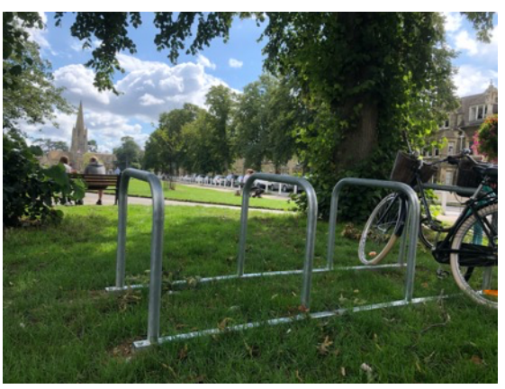
Andrew pushed for the new bike racks in the town centre

give more space for people visiting the town centre and reduce the spread of Covid-19. He has proposed planters and "road open" signs for a more welcoming feel.