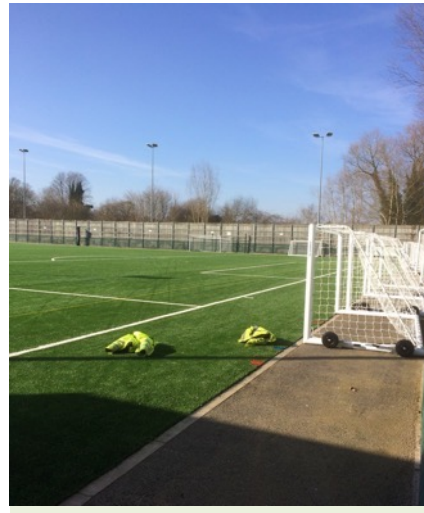
SPORTS & LEISURE: pushing for improved facilities and more pitch capacity