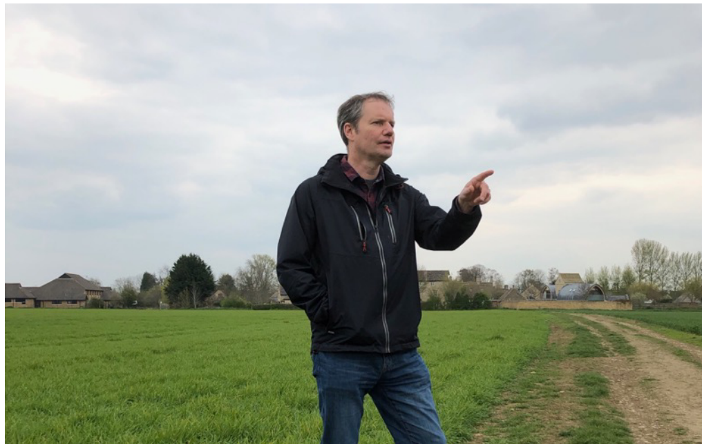
PLANNING: successfully challenged application for 110 houses behind Hailey Road