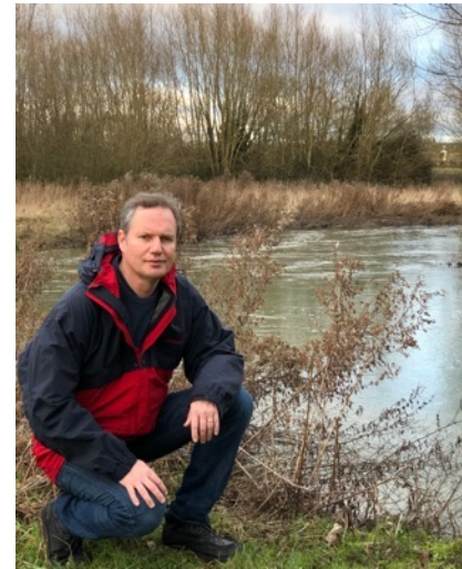
RIVER POLLUTION: challenging Thames Water to end sewage pollution