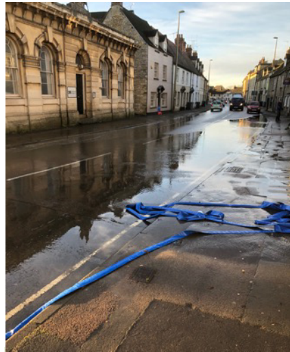
FLOODING: helping residents and calling for joined-up action on flood prevention

Since you elected him as your Green Party Councillor on Witney Town Council in May 2019, Andrew has worked hard on issues such as the planned housing developments, safe walking and cycling, air quality in Bridge Street, flood prevention and river pollution. He successfully challenged a planning application for 110 houses off Hailey Road over the lack of vital infrastructure, including an adequate sewage system.