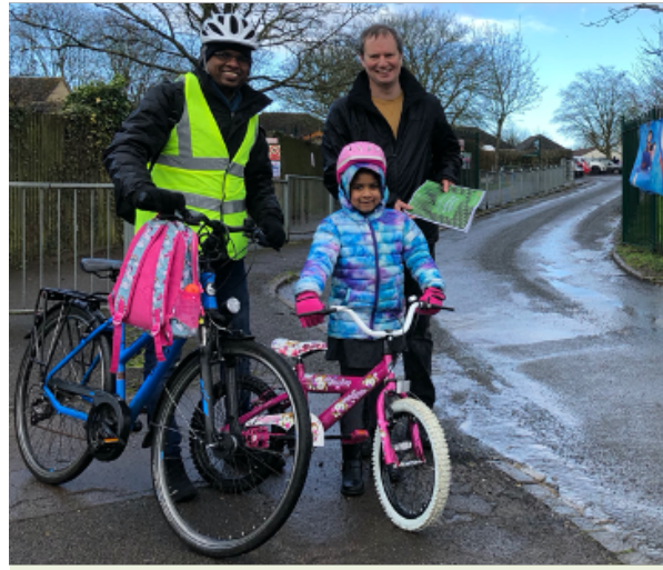
SAFE ROUTES TO SCHOOL: ran a petition and developed proposals for measures to encourage walking and cycling